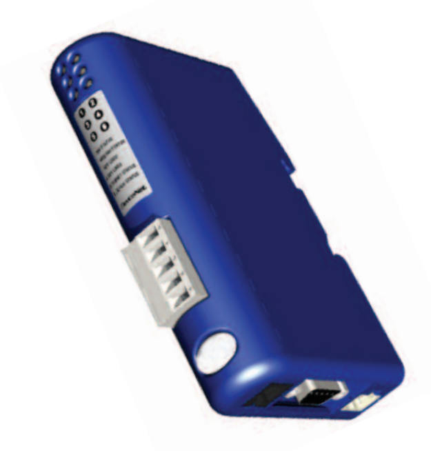
EC700 - Modbus Gateway