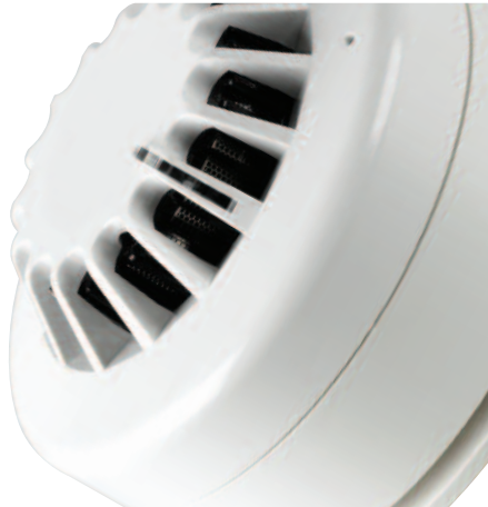
CAS380 with sensor fitted