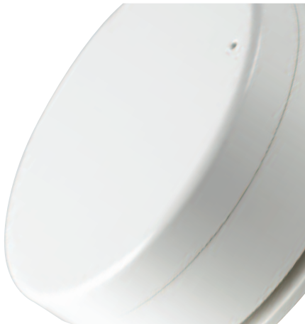
CAS380 with cover fitted (CASC)