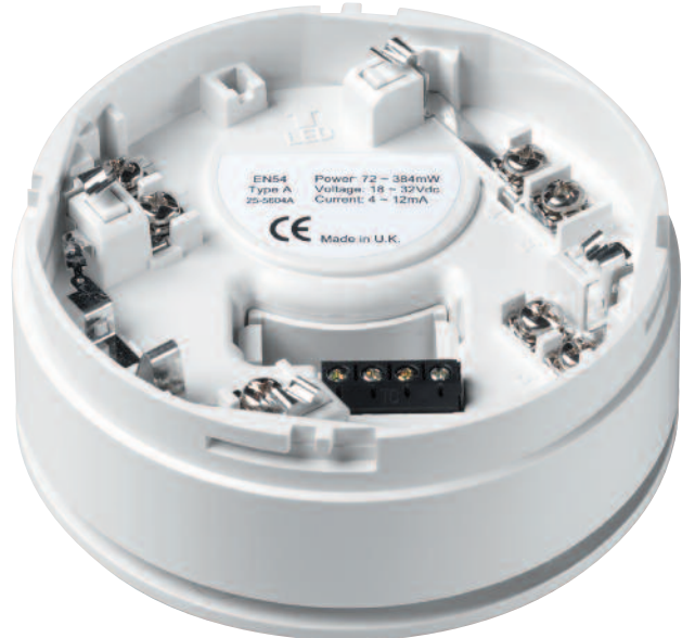
CAS380 - Sounder Base