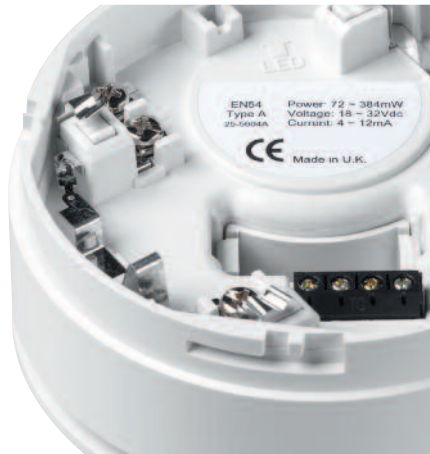
CAS380 - Sounder Base