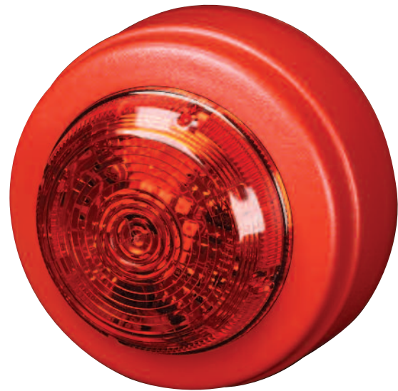
CAB382 - Loop Connected LED Beacon